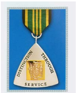
The insignia of the Order of Distinction (Officer Class) – OD

The insignia of the Order of Distinction in the rank of Commander is a triangular badge with curved sides. In the centre is a black medallion bearing the heraldic Coat of Arms of Jamaica in gold. The words of the motto of the Order are in black. The Badge is suspended from a silk collar riband of black, gold and green by a silver finial of two intertwined letters "J" attached to the uppermost point of the triangle. Members of this rank use the post nominal letters 'CD' and 'CD (Hon)' for honorary members.