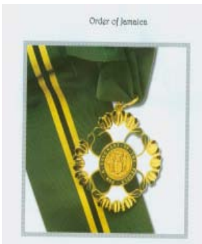
The insignia of the Order of Jamaica