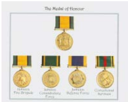
Insignias of the Medal of Honour

The Medal of Honour is awarded to members of the state's security corps and other uniformed groups, and falls into two categories.