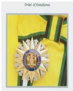
The insignia of the Order of Excellence