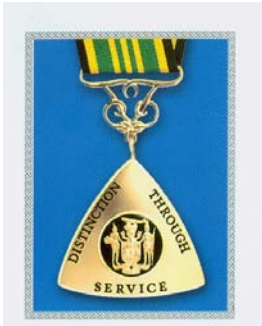
The insignia of the Order of Distinction (Commander Class) - CD

The Order of Distinction may be conferred upon any citizen who has rendered outstanding and important service to Jamaica in any field of endeavour. The Order has two ranks; the higher class - Commander - being the higher of the two. Distinguished citizens of a country other than Jamaica may be conferred with this honour as honorary members. The motto of this Order is ' Distinction Through Service '.