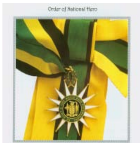
The insignia of the Order of National Hero

The Order of National Hero , established in 1969, is the highest of the Orders and may be conferred on any Jamaican or naturalised citizen who has rendered the most distinguished service to Jamaica. The recipient is styled 'The Right Excellent' and wears the insignia of the Order.