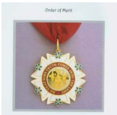
The insignia of the Order of Merit

The Order of Merit is the third highest honour and may be conferred upon any citizen of Jamaica who has achieved eminent international distinction in his or her field of endeavour. A distinguished citizen of a country other than Jamaica may be conferred as an honorary member of this Order.